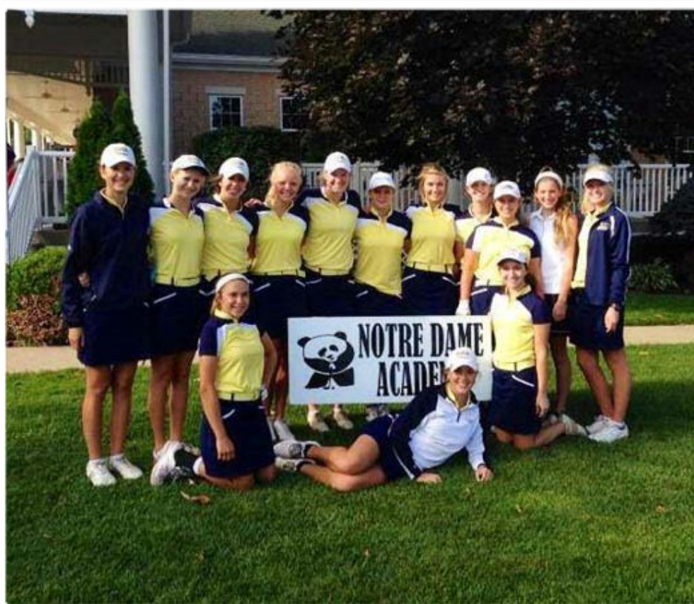
Panda golfers at the Region 6 tournament at Twin Oaks. Notre Dame won the Division I championship for the 10th consecutive year.