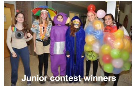
Junior contest winners

Many people had a unforgettable night with some of the freakiest haunted houses in October: U.S.S. Nightmare, Fearfest, Dent Schoolhouse, and Land of Illusion. Along with the haunted houses, many scary movies came out; hope you don't mind having nightmares. Anabelle , Oujia , The Conjuring , and The Quiet Ones are surely worth watching; just make sure you aren't alone.