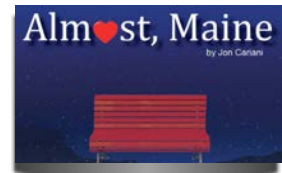
ALMOST, MAINE: FALL PLAY AMUSES, ENTERTAINS, PAGE 9