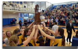
VOLLEYBALL: PANDAS FALL JUST SHORT IN STATE FINAL, PAGE 2