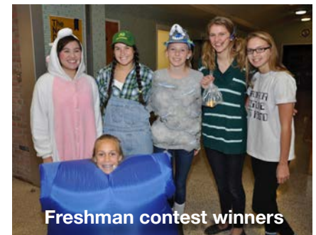
Freshman contest winners