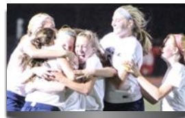
SOCCER: ANOTHER BIG SEASON FOR PANDAS, PAGE 3