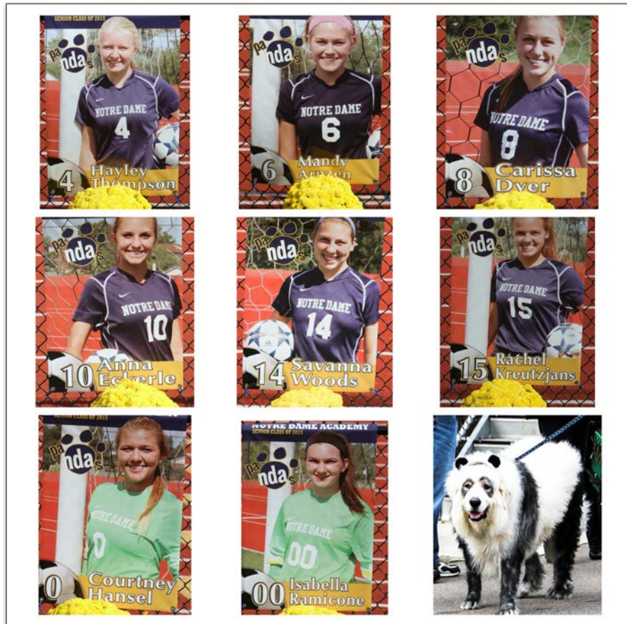
Senior soccer Pandas and sometime-Panda mascot Simba.