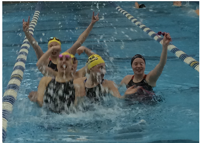
Panda swimmers celebrate a strong performance at regionals.

The Notre Dame swimming and diving team continues to dominate the water. The Pandas won their 17th consecutive NKAC title on Jan. 31 and their 17th consecutive regional title Feb. 13-14 at Silverlake. NDA qualified 14 swimmers and three divers to the state meet Feb. 27-28 in Louisville.