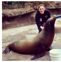
WORKING PANDAS FIND BALANCE. 2-3