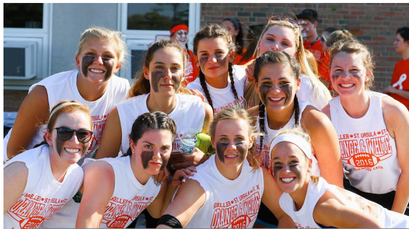
Senior Pandas get their game faces on for the Orange and White game against St. Ursula.