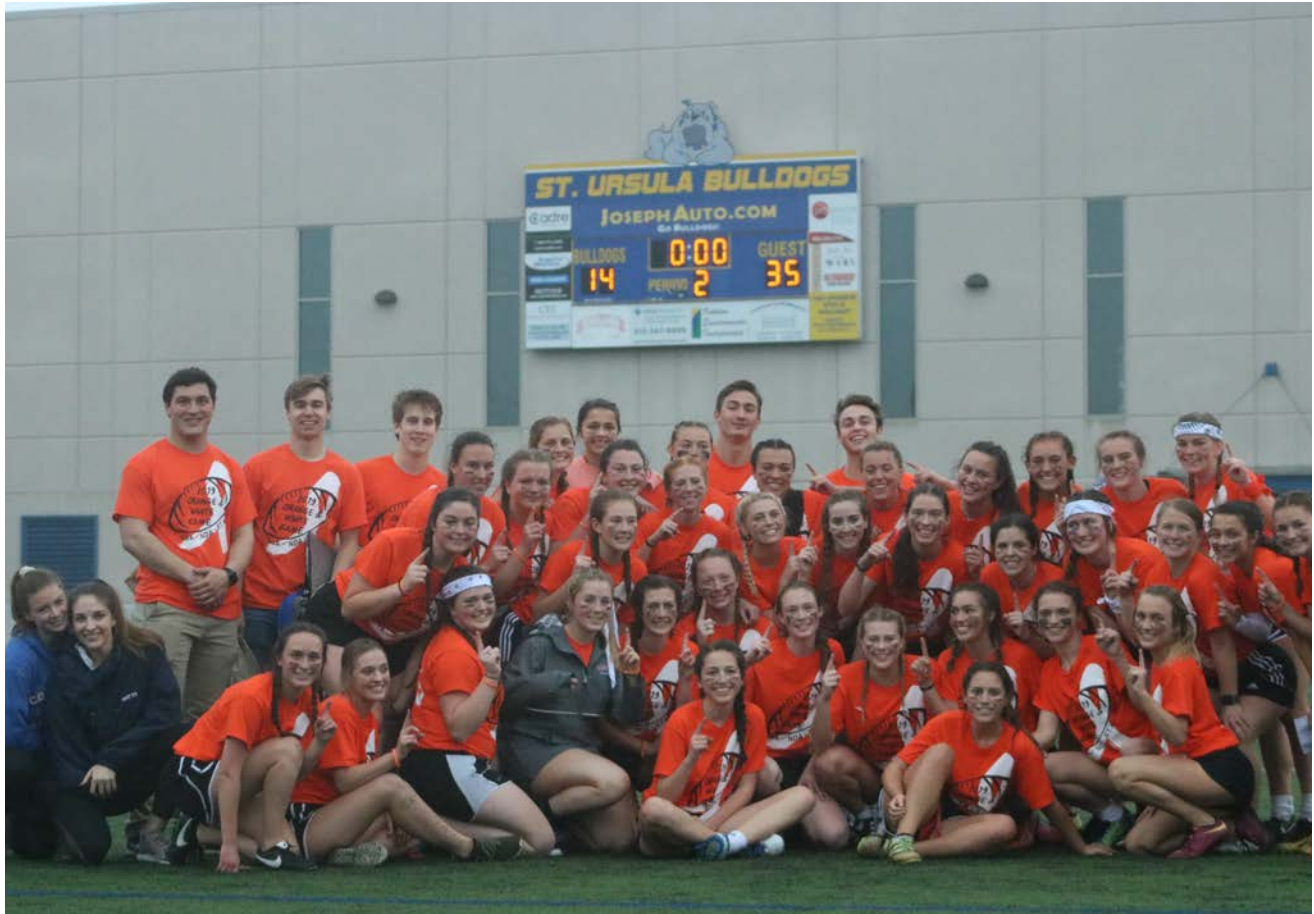
Victorious players and coaches gather for a photo moments after Notre Dame Academy's 35-14 victory over St. Ursula Academy on Sunday in the annual Orange & White flag-football game.