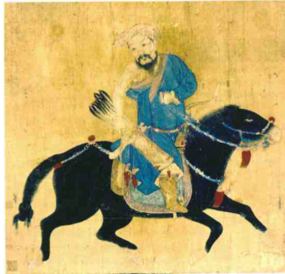
A Mongol Warrior Horseback-riding skills, honed in herding animals and adapted to military purposes, were central to Mongol conquests, as illustrated in this Ming dynasty Chinese painting of a mounted Mongol archer.

An impressive discipline and loyalty to their leaders characterized Mongol military forces, and discipline was reinforced by the provision that should any members of a unit desert in battle, all were subject to the death penalty. More positively, loyalty was cemented by the leaders' willingness to share the hardships of their men. "I eat the same food and am dressed in the same rags as my humble herdsmen," wrote Chinggis Khan. "I am always in the forefront, and in battle I am never at the rear." 6 Such discipline and loyalty made possible the elaborate tactics of encirclement, retreat, and deception that proved decisive in many a battle. Furthermore, the enormous flow of wealth from conquered civilizations benefited all Mongols, though not equally. Even ordinary Mongols could now dress