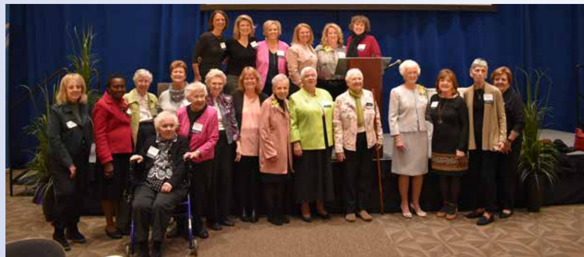
Pictured above are the current and past Women Making A Difference honorees in attendance at this year's luncheon.

If you would like to nominate a Notre Dame Academy alumna who has made significant contributions to her family and community through service, professional, and philanthropic efforts, you can do so on NDA's website at www.ndapandas.org » Support NDA » Major Events » Women Making a Difference or with the nomination form on page 32.