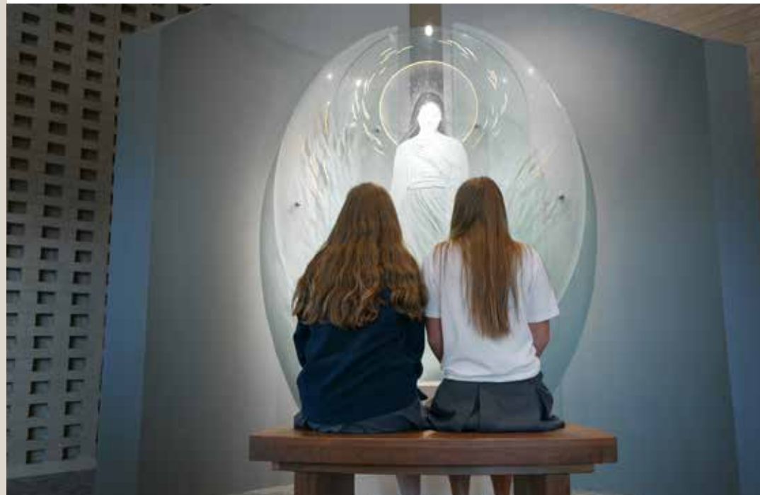
Students enjoy spending time in prayer at the Marian shrine within our Mary, Mother of the World Chapel.

The Notre Damian is published three times per year for alumnae, parents, faculty, staff, administration, and friends of Notre Dame Academy. The Notre Damian is a publication of the Notre Dame Academy Advancement Office.