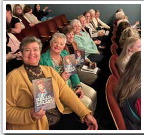
In February, a group of friends from the Class of 1970 reminisced about their senior class play while attending the performance of "Hello Dolly" at the Carnegie Theatre in Covington, KY.