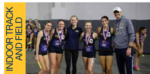
INDOOR TRACK AND FIELD